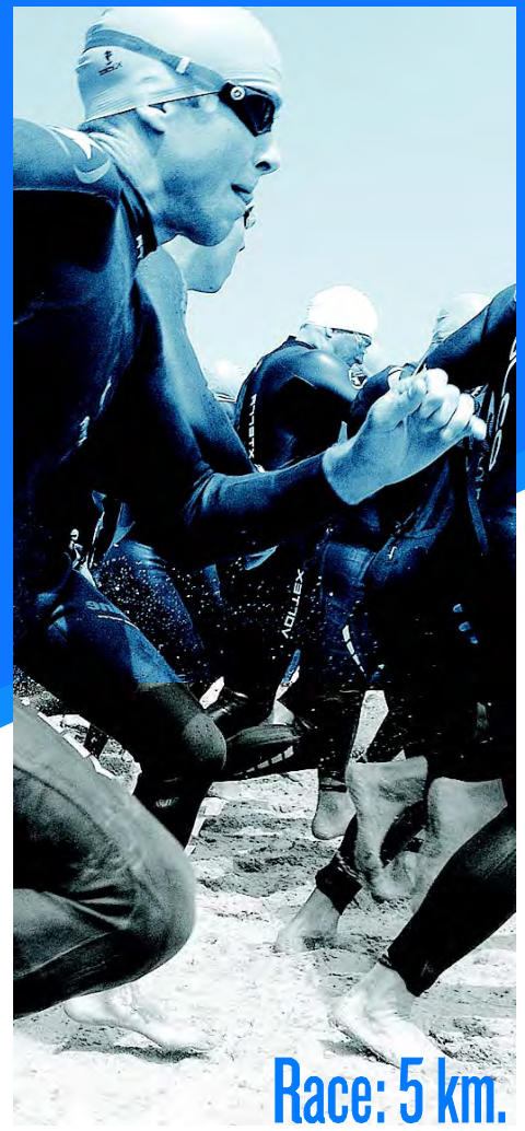
Race: 5 km.