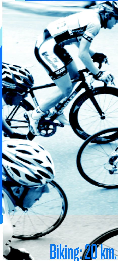
Biking: 20 km.