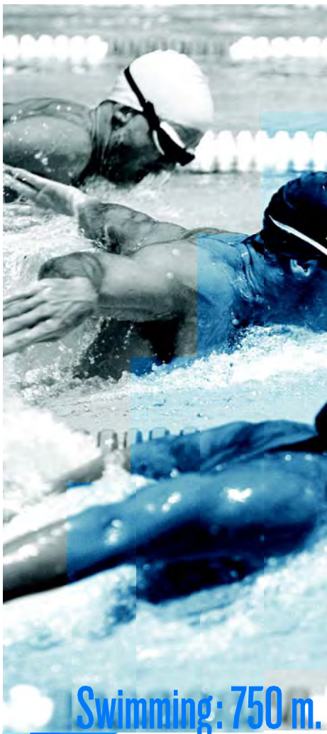
Swimming: 750 m.